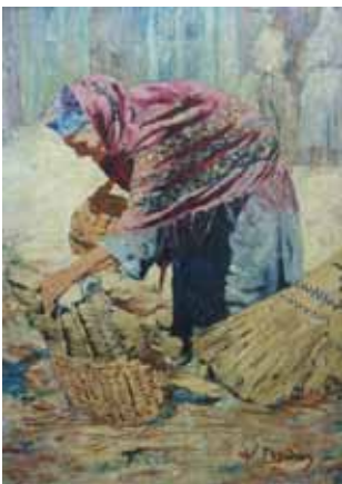
Table III/4: Daniel Kabiljo, The Old Sephardic Women on The Market , oil on canvas, 1935, courtesy of the City Museum of Sarajevo