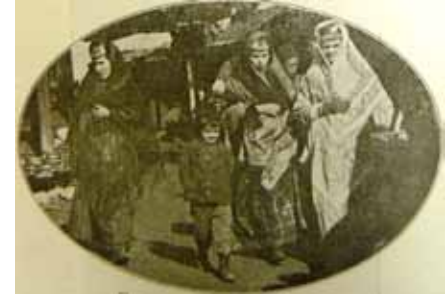
Tables II/4: Sephardic women on a street in Sarajevo, photograph published in Dr. Moric Levi, Die Sephardim in Bosnien , Sarajevo, 1911