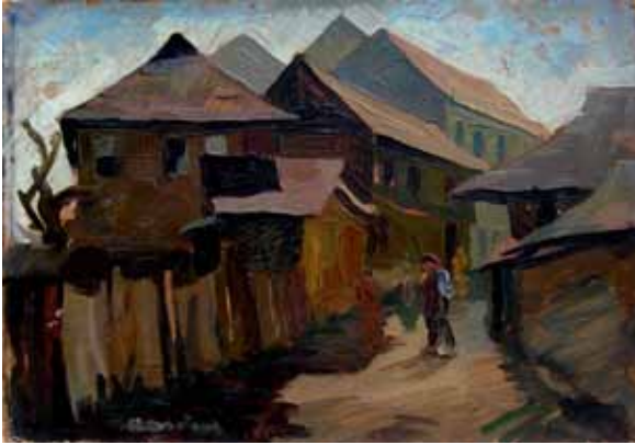
Tables IV/1: Daniel Kabiljo, From the Outskirts of Sarajevo , oil on canvas, 1920s-1930s, courtesy of the Art gallery of Bosnia and Herzegovina, Sarajevo