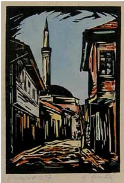
Tables IV/2: Daniel Kabiljo, A Street in Sarajevo , colored linocut, 1920s-1930s, courtesy of the Art gallery of Bosnia and Herzegovina, Sarajevo