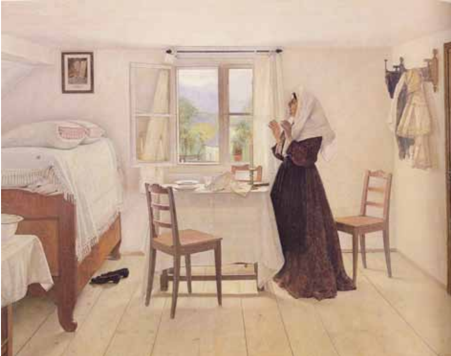
Fig. 7: Isidor Kaufmann, Blessing the Sabbath Candles , oil on canvas, ca. 1900-10, private collection, New York

During the 1920s and 1930s Kabiljo himself often painted members of different ethnic groups living in old Sarajevo quarters and in the colorful Baščaršija, the old Turkish marketplace (Table II/1-2). Simultaneously, he continued to paint local Jewish types, as well. Occasionally, he used photographs from Dr. Moric Levi's book in order to re-create the old world's now vanishing atmosphere (Table II/3-4). Much later, in 1953, probably in memory of his Jewish friends who had perished in the Holocaust, Bosnian Croat painter, Petar Tiješić used the same source when painting the famous Sarajevo Jewish pharmacy which had belonged for several centuries to the local Papo family (Table II/5-6). Moreover, the same subject was rendered sometimes by several artists—Jews and gentiles—such as the tinsmith, which was an old Jewish profession (Table III/1-3). It is also interesting to contrast Kabiljo's Old Sephardi Woman in the Market with his Conversation , both painted in the 1930s (Table III/4-5). While the former, despite its lighter colors and free brushwork, depicts the more traditional