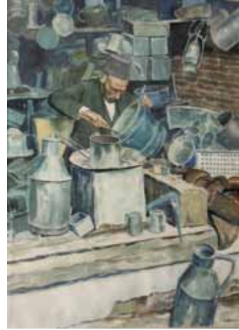
Tables III/2: Petar Šain, The Tinsmith , oil on canvas, 1920s, private collection, Sarajevo