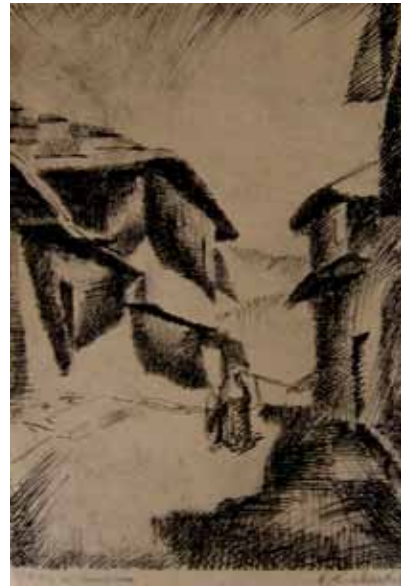
Tables IV/3: Daniel Kabiljo, A Street in Sarajevo , India ink on paper, 1920s-1930s, courtesy of the Art gallery of Bosnia and Herzegovina, Sarajevo