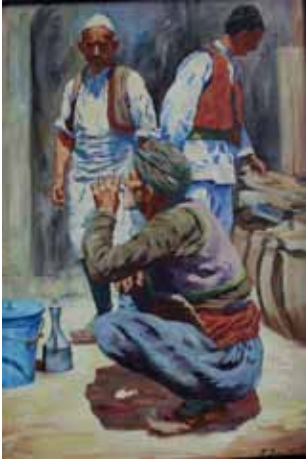
Table II/1: Daniel Kabiljo, Motifs from Sarajevo's Old Turkish Market (Baščaršija) , oil on canvas, 1920s-1930s, private collection, Sarajevo