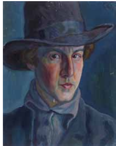
Table I/5: Roman Petrović, Self-portrait , oil on canvas, 1918-19