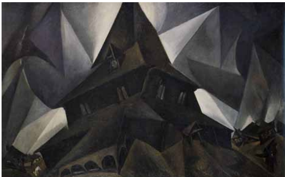
Fig. 10: Issachar Ber Rybak, The Old Synagogue , oil on canvas, 1917