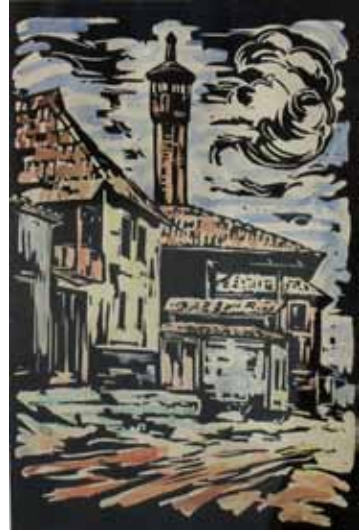
Tables I/2: Daniel Kabiljo, A Street in Sarajevo , colored linocut, 1937(?), private collection, Sarajevo