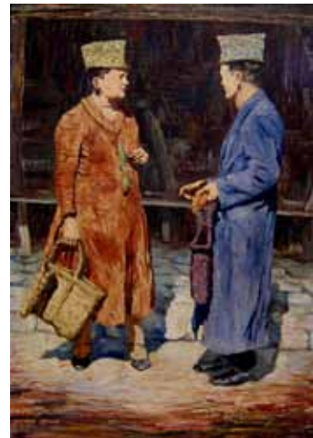
Table III/5: Daniel Kabiljo, The Conversation , oil on canvas, 1930s