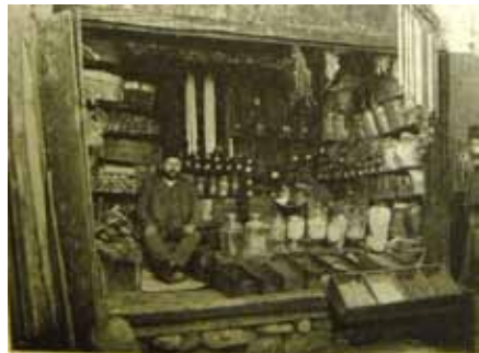
Tables II/5: Petar Tiješić, The Old Jewish Pharmacy , oil on canvas, 1953