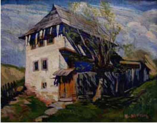
Tables I/1: An Old House , oil on canvas, 1930s, courtesy of the Art gallery of Bosnia and Herzegovina, Sarajevo