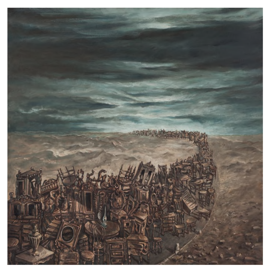
Fig. 11. Yosl Bergner, Destination X , 1969. Oil on canvas. 100 \times 100 cm.

entering the consciousness and memory of diverse individuals when provoked emotionally or culturally. As issues of exile, place, homeland, belonging continue to reverberate in the modern Jewish and