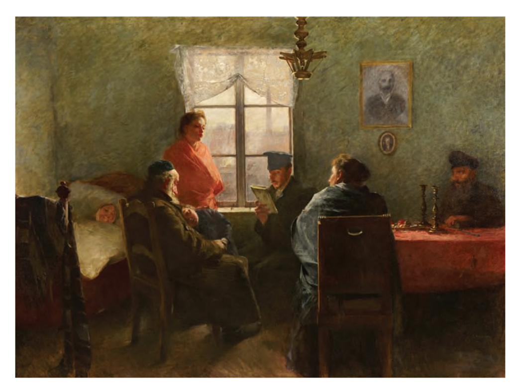
Fig. 2. Samuel Hirszenberg, Sabbath Rest, 1894. Oil on canvas, 149.5 \times 206.5 cm.

and probably to the additional title given the painting ("Letters from Argentina"). A fascinating echo of such thoughts appears in He Will Wait (1891), a painting by the Russian Jewish artist Leonid Pasternak. There an elderly Jew sits hunched over in deep introspection and thought, his hands clasping a wanderer's cane, as he contemplates his destiny.9 Pasternak's image was later used for postcards entitled Le-an? (Whither); the title clearly refers to Mordekhai Ze'ev Feierberg's bestknown story (1899-1900). All these works were reacting to the crossroads East European Jewry encountered at the turn of the century and the clash between tradition and modernity; between the Old World and the new opportunities offered to those who decided to leave it (voluntary or forcefully) and emigrate to the New World.10