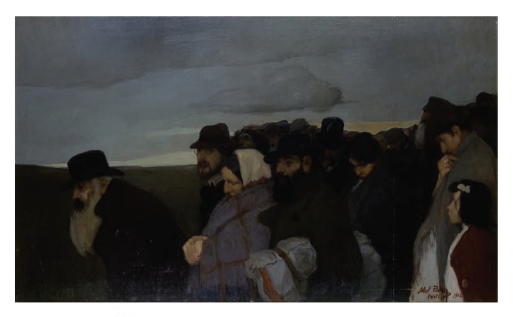
Fig. 5. Abel Pann, Refugees, 1906. Oil on canvas. 97 \times 60 cm, The Israel Museum, Jerusalem.