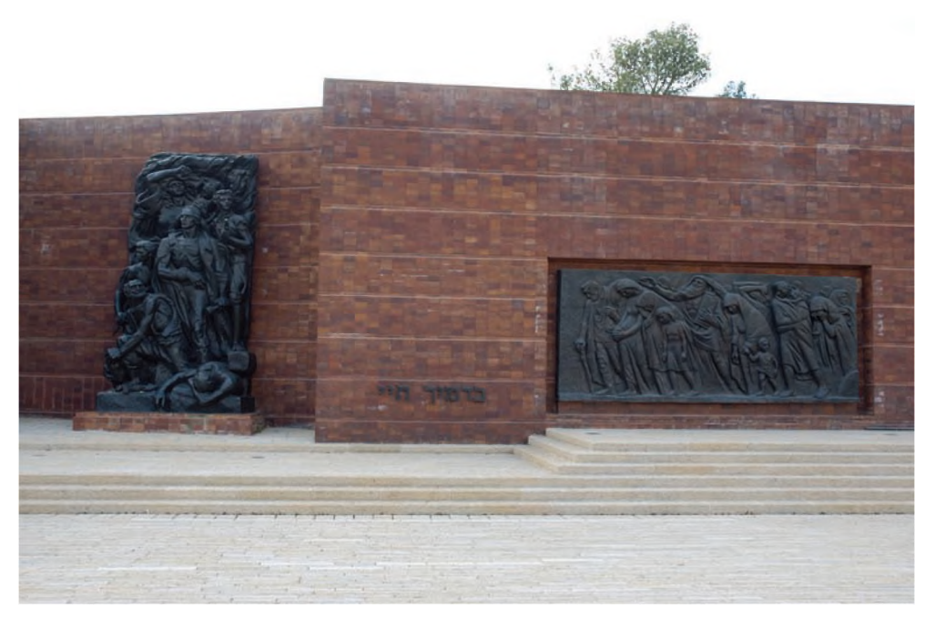
Fig. 10. Nathan Rapoport, Warsaw Ghetto Monument , 1948/1973. Yad Vashem.

the fighting spirit of the underground, the reverse side has merged historical depictions of exile. On that side Rapoport has integrated the procession motif of the famous Arch of Titus in Rome (where Roman soldiers are seen carrying out booty from the Temple) and elements of Hirszenberg's Exile. The hinted presence in the procession of Nazi soldiers, seen only by their bayonets and helmets, makes the destination of the downcast Jews overly apparent. It is a death march of men, women, and children. Twenty-five years later, in 1973, Yad Vashem in Jerusalem decided to commission a reproduction of the monument for its remembrance plaza (fig. 10). The plaza moved away from the twosided monument and shows in a book-like shape, "both sides simultaneously, inviting the eye to follow the procession from archetypal martyrs from right to left to heroically rising figures." The tableau of martyrs has been reproduced in various sizes and has become commonplace in institutions that commemorate the Holocaust. In this sense, Rapoport's monument on the eastern wall added a dimension to Exile that began to appear in some of the art work during the war and