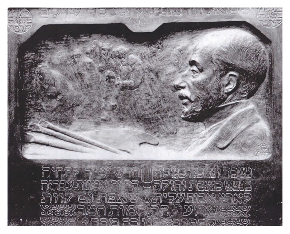
Fig. 7. Boris Schatz, The Memorial Plaque Dedicated to Hirszenberg , ca. 1914.

the symbol for the old detested world, of exile and non-belonging, of a world of frustration and anger, as earlier expressed by Brenner's protagonist. In a letter written in 1916, during World War I, by Moshe Sharett to Rivka, his elder sister, the future prime minister of Israel included a postcard of Hirszenberg's Galut (as Sharett cited it), and added the comment: I would call this interesting postcard "the role of the Jew in the universal war." A year later he received a letter from his sister who described to him in detail the exile of Jews from Tel Aviv-Jaffa by the Ottoman Empire, and she added: "Are we children of the land, connected to the land and think that our lives are connected to the place where we live, our homeland, the land of our efforts/work (שרק עמלט).