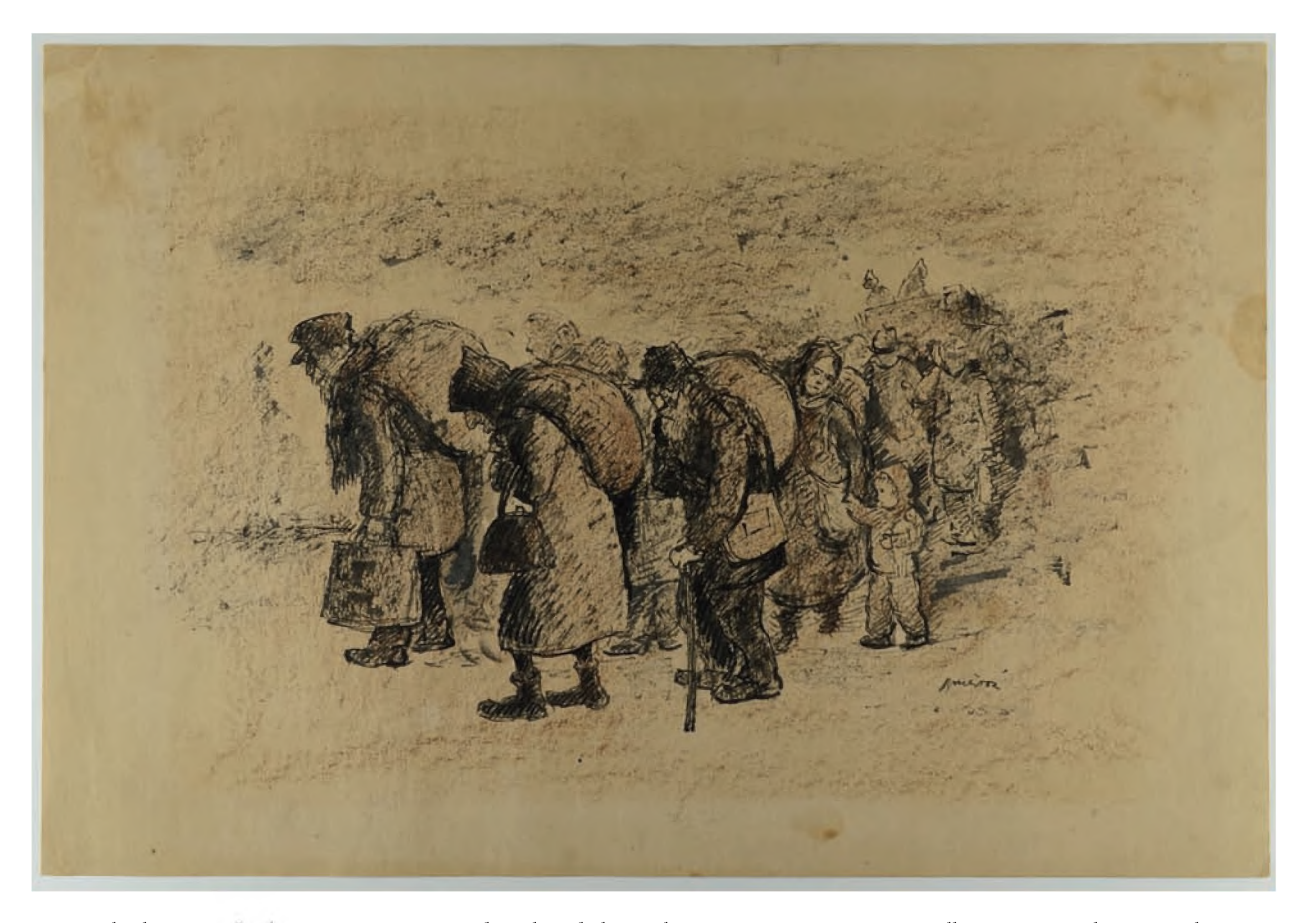
Fig. 9. Charlotte Burešovå, Deportation , 1965. India ink and charcoal, 30 \times 42 cm. Courtesy Art Collection, Beit Lohamei Haghetaot—Ghetto Fighters' House Museum, Israel, cat. no. 1006.

In contrast to these artists, Bedrich Fritta (the pseudonym of Fritz Taussig) created numerous scenes depicting the hardship of his imprisonment in Theresienstadt. As head of the drawing studio in the Jewish self-administration's technical department, he used the office supplies to create unofficial drawings depicting the misery of the ghetto life. Once caught, together with the entire group of artists, he was imprisoned and later sent to Auschwitz, where he perished in 1944. Before being deported, the artists managed to smuggle out and hide their drawings, which survived the war.<sup>47</sup> One of the undated works entitled Incoming Transport II shows a long trail of people, diminishing towards the horizon, most of them old and frail, bent under their possessions marked by numbers. 48 They are facing towards the left side of the drawing, as in