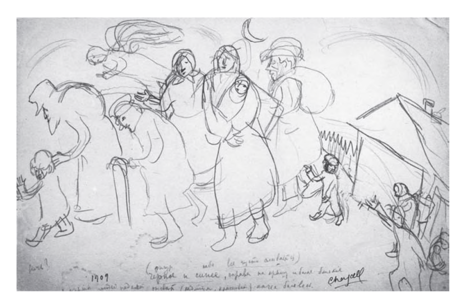
Fig. 6. Marc Chagall, Exodus , 1909, pencil on paper, 21.9 \times 35.6 cm, private collection © ADAGP, Paris [2015].

Broken and rejected in the Diaspora With a painful and sick soul To the land of your forefathers you migrated To renew your days in the rebirth To revive the Hebrew art You aspired and hoped Why did bitter death Take you from us so soon?<sup>34</sup>