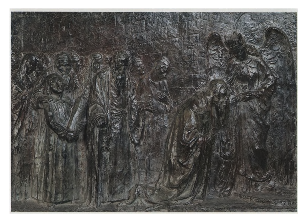
Fig. 4. Henryk Hochman, The Arrival of Jews to Poland , 1907–1910.

Two years later the painting was exhibited in a more favorable venue with less than 200 works of art, the Ausstellung Jüdischer Künstler in Berlin at the Gallery for Ancient and Modern Art, and illustrated in its small catalogue. In his introduction to the catalogue, Alfred Nossig, the sculptor and eclectic intellectual, remarked on what he considered the unique art of Jewish artists—their portrayal of exile, wandering, suffering, and the ghetto experience—what he called the art of Heimatlosigkeit (homelessness).29 Certainly Exile (called Verbannung in the exhibition) figured prominently in the minds of the catalogue's editor and the exhibition's organizers, but even more so in the thought of certain Zionists. Berthold Feiwel, a collaborator of Buber's, and a leading Moravian Zionist, who was a central figure in Zionist cultural projects in the west, hailed the painting's enduring social message. On seeing it amidst the exhibition of other works by Jewish artists, Feiwel proclaimed that Exile overshadowed them all, for it alone succeeded in synthesizing the Jewish experience of the age. It would appear that Feiwel viewed