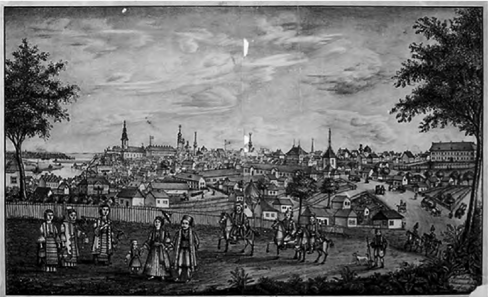
Figure 1. The Belgrade in the Mid-19 th century