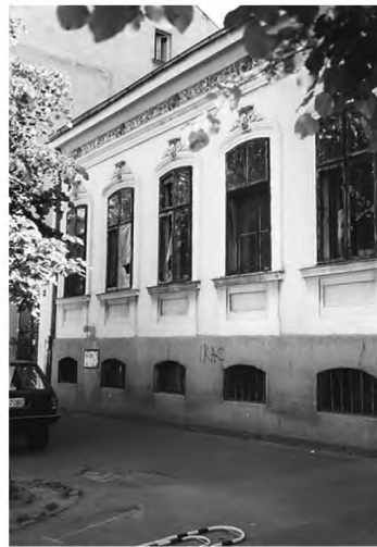
Figure 3. The mid-19 th century houses in the west Vračar area

Many houses in the west Vračar area are today under the process of restitution because they were confiscated and nationalized after the WWII and their heirs expecting them to be returned. Some of the houses, like the Veljković's house, a listed cultural property, have been returned to their heirs. 1