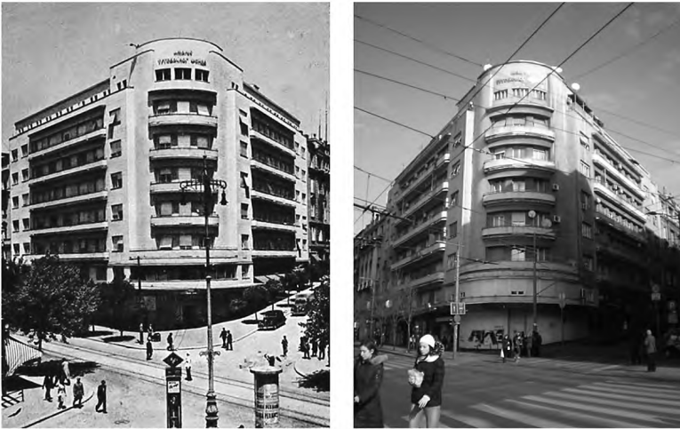
Figure 11. The Trade Fund building, in past and today

The Trade Fund also expects restitution of multi-storey residential building designed by arch. Branislav Marinković in 1932, one of best representatives of Belgrade architectural Modernism. 8