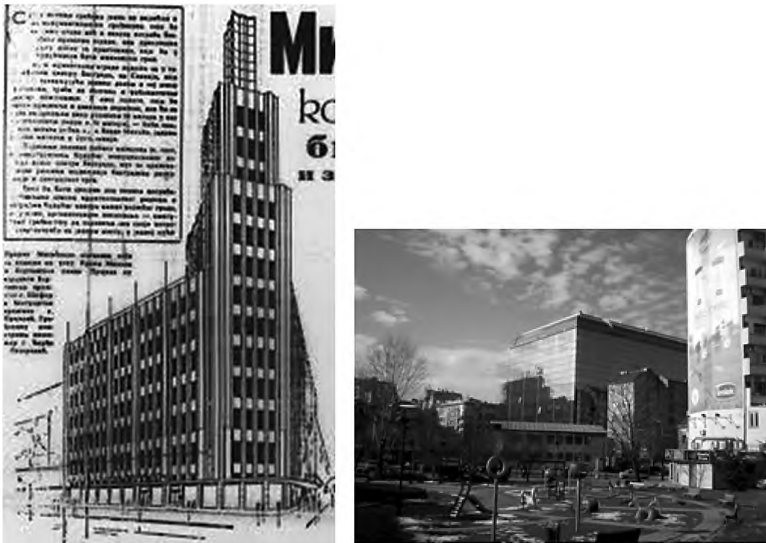
Figure 13. The project for modern department store and Mitić's Pit today

An interesting example is a so-called Mitić's Pit. One of the most prominent historical settings of Belgrade is Slavija Square where before WWII a famous merchant Vlada Mitić planned to build a modern department store. But the war stopped the construction, so only the foundation pit was left. After the war the plot was neglected.