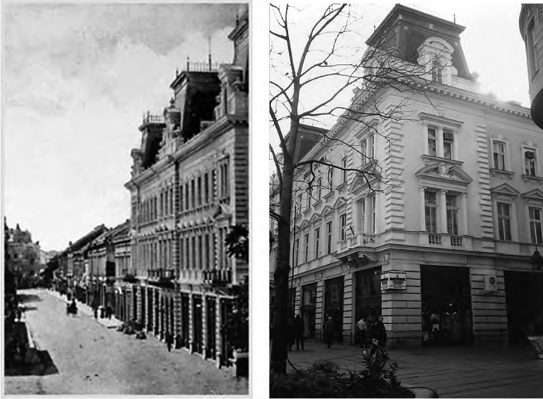
Figure 8. The Nikola Spasić Fund house, in the past and today

towards a cultural property of great value. 5 Perhaps, the restitution process and returning the building to its original owner could ensure a better treatment of the building in future.