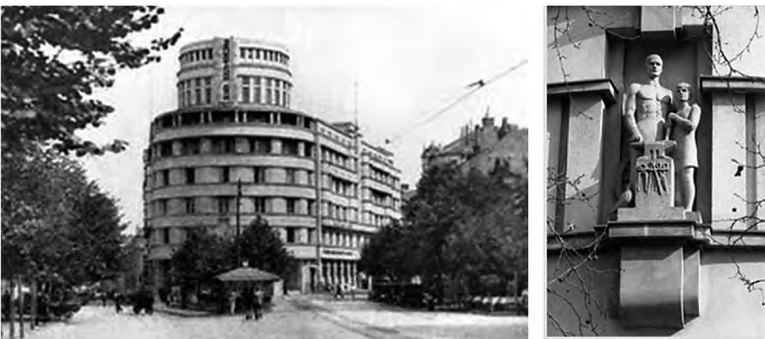
Figure 12. The Artisans' Club

The Artisans' Club ( Zanatski dom ), was erected in 1933, according to design of architect Bogdan Nestorović. Apart from the offices of different artisan associations and unions, there was a hotel and a movie theatre. From 1947 the building houses Radio Belgrade. 9