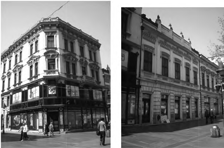
Figure 7. The former Mitić Department store, Knez Mihailo street

There is a situation with some buildings, like the three ones on Knez Mihailo street, 3 which used to be the Mitić department store, where the new owner have gone bankrupt today and the buildings are closed and neglected. Such a situation largely degrades the overall setting of this prominent street – listed as a cultural property of outstanding value. 4