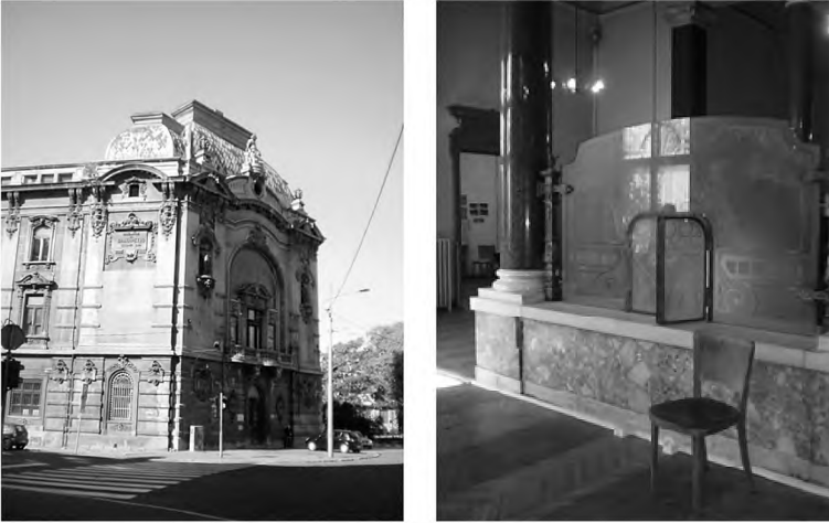
Figure 9. Belgrade Credit Union building

There are also other funds from the period between the two world wars, claiming substantial real property nationalized after the WWII and given to various public institutions for their use.