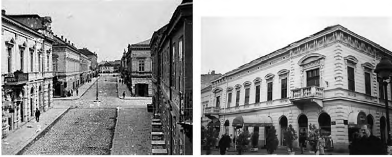
Figure 6. The old 19 th century buildings in Knez Mihailo street

There is a situation with some buildings, like the three ones on Knez Mihailo street, 3 which used to be the Mitić department store, where the new owner have gone bankrupt today and the buildings are closed and neglected. Such a situation largely degrades the overall setting of this prominent street – listed as a cultural property of outstanding value. 4