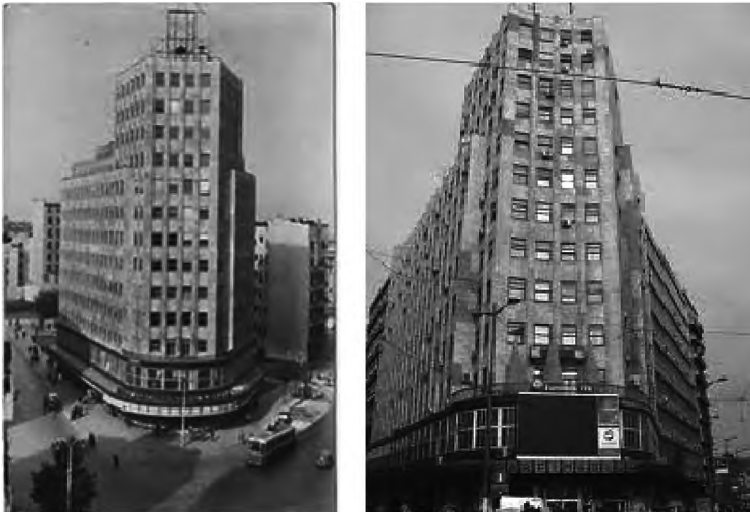
Figure 10. The Albania Palace, in the past and today

One of examples is the Albania Palace , at the time the tallest building in the Balkans, erected for the Trade Fund ( Trgovački fond ) in 1940, designed by the architects Branko Bon, Milorad Grakalić, Miladin Prljević and engineer Đorđe Lazarević. 7