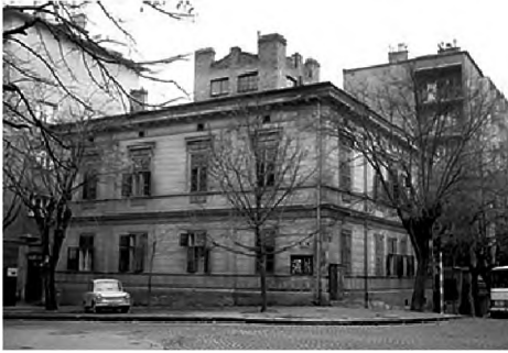
Figure 4. The Veljković's house in the west Vračar area

ownership of the land – property of the Muslims, Serbs and Jews (Đurić-Zamolo 1977, 214). Favourable circumstances for urban transformation came when Prince Mihailo Obrenović finally managed to accomplish the final withdrawal of the Muslim population in 1867. Serbian government and wealthy citizens started to buy out property from the Muslim owners and to build new public and private houses.