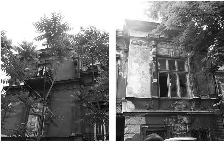
Figure 5. The family house of architect Jovan Ilkić

In the mid-19 th century Muslim population was still dominant at the Belgrade Old Town surrounded by the trench. The plan dates from 1862, showing the