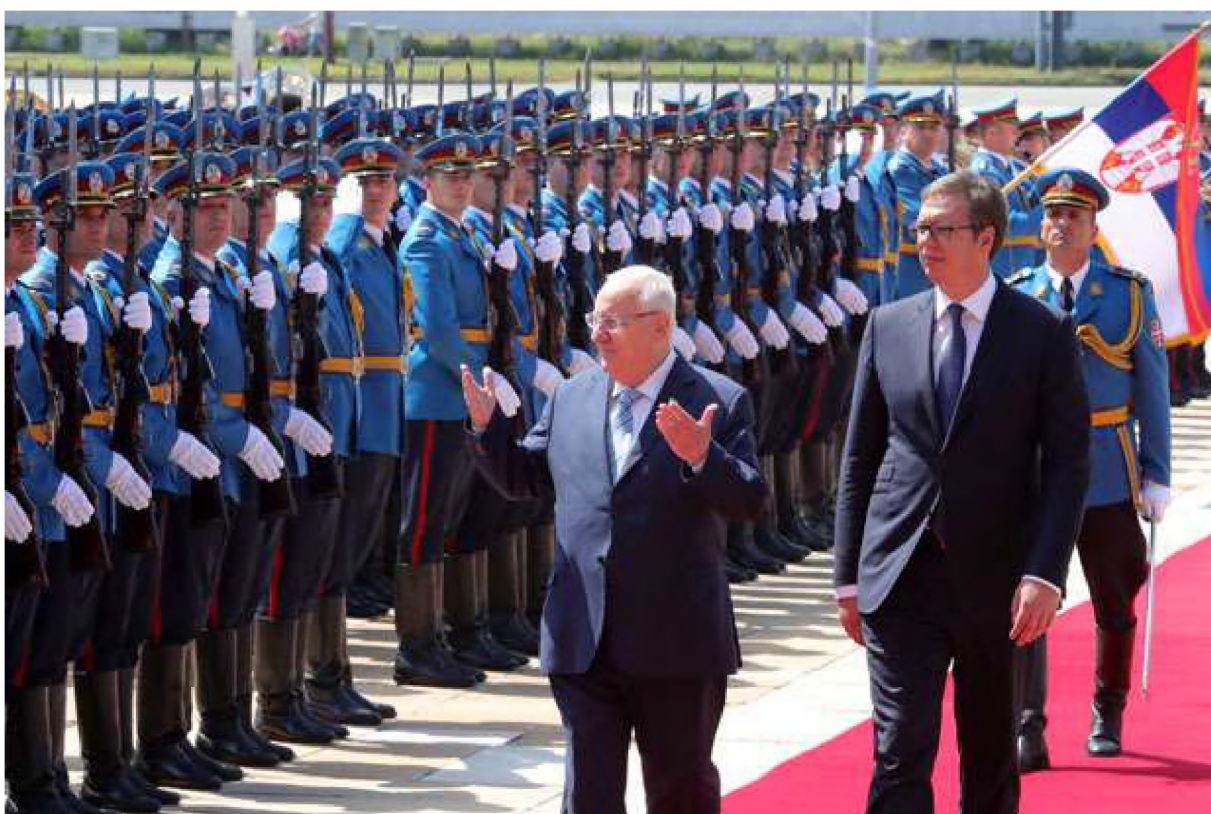
Predsjednici Izraela i Srbije na ceremoniji dobrodošlice Presidents of Israel and Serbia in a welcome ceremony