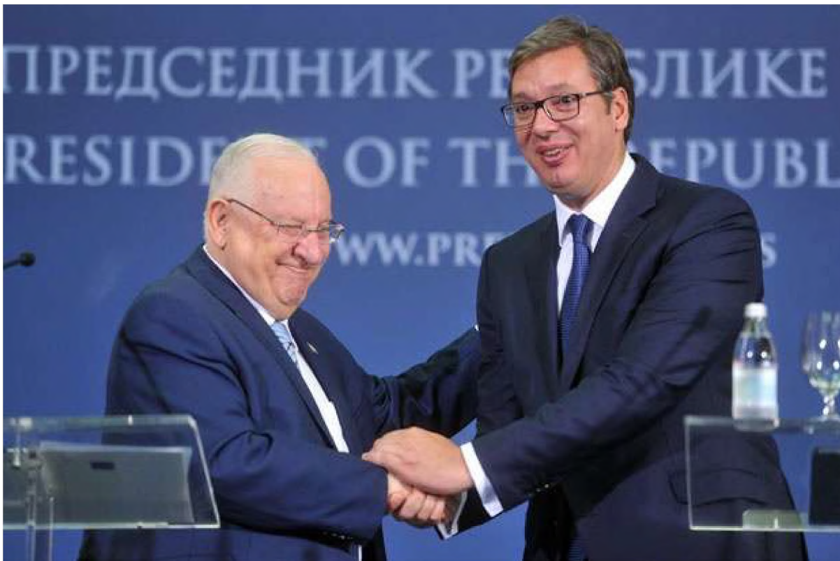
Predsjednici Izraela i Srbije, Rivlin i Vučić Presidents of Israel and Serbia, Rivlin and Vučić