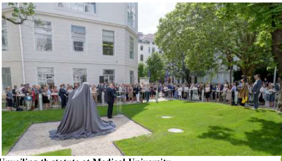
Unveiling th statue at Medical University

On June 4th, I attended a special event of the unveiling Sigmund Freud's statue. This finally found an appropriate place at the Medical University Campus in Vienna, where the famous psychoanalyst studied and did so much important research.