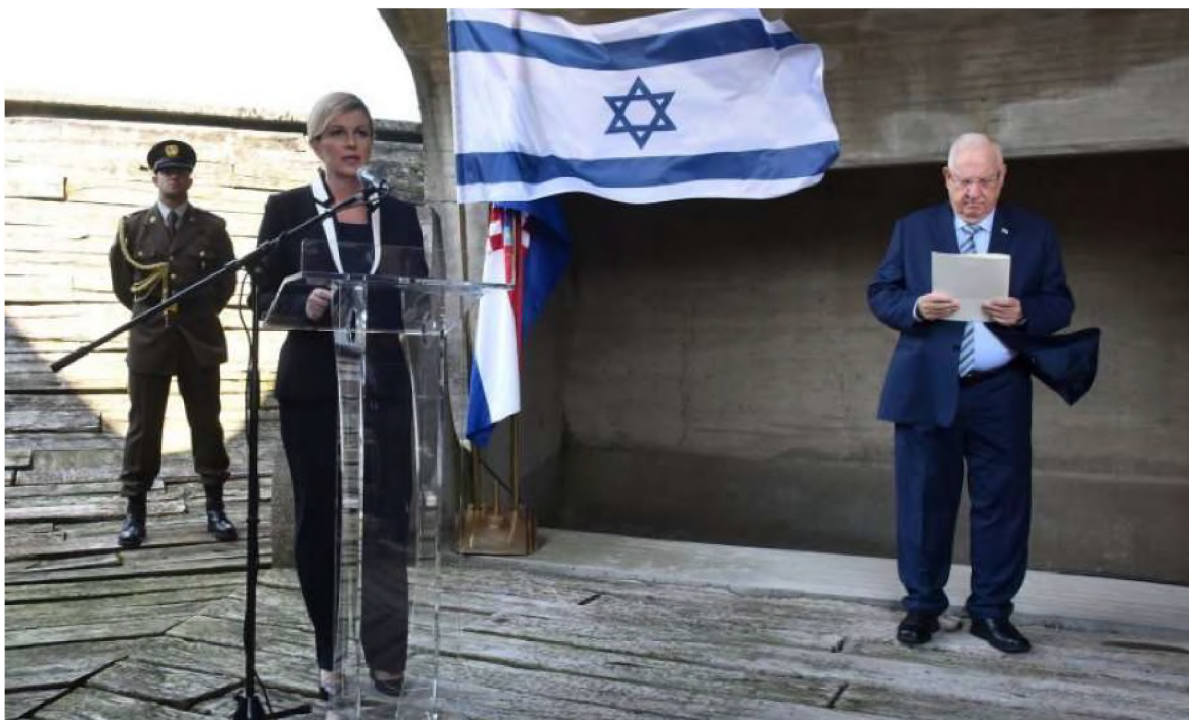
Rivlin i Grabar Kitarović u Jasenovcu Rivlin and Grabar Kitarović in Jasenovac