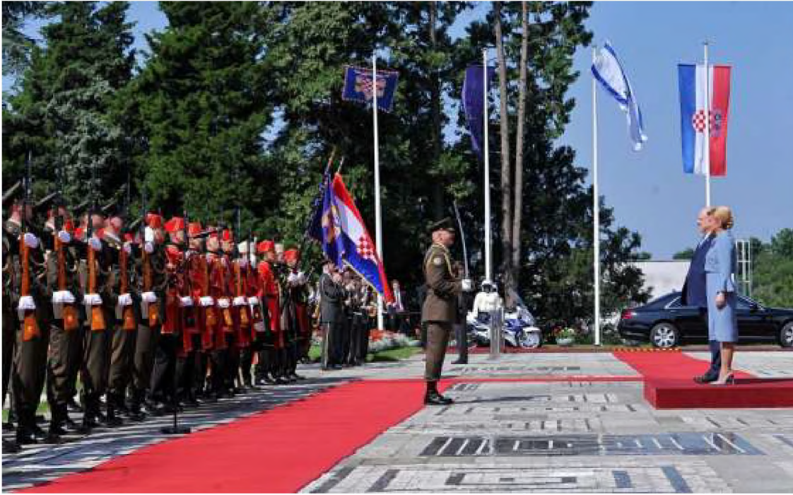
Predsjednik Izraela i predsjednica Hrvatske na ceremoniji dobrodošlice Presidents of Israel and Croatia in a welcome ceremony