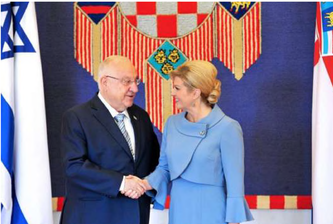
Susret predsjednika Izraela i hrvatske predsjednice President of Israel meets Croatian President