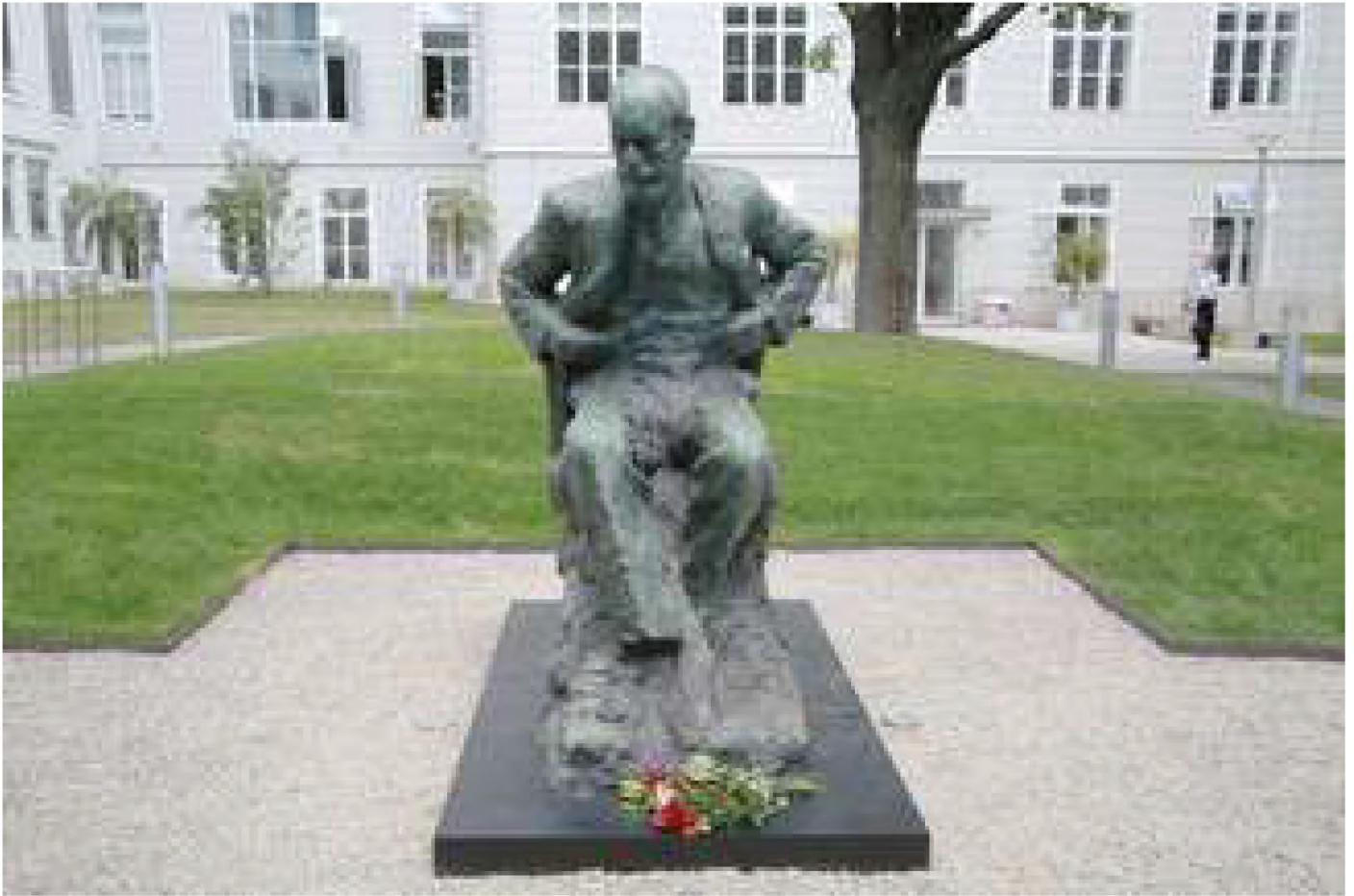
Sigmund Freud's statue at Vienna Medical University

80 years after Sigmund Freud was forced to leave Vienna on 4th June 1938, the Medical University of Vienna unveils an over life-sized sculpture of Freud created by Oscar Nemon in 1936.