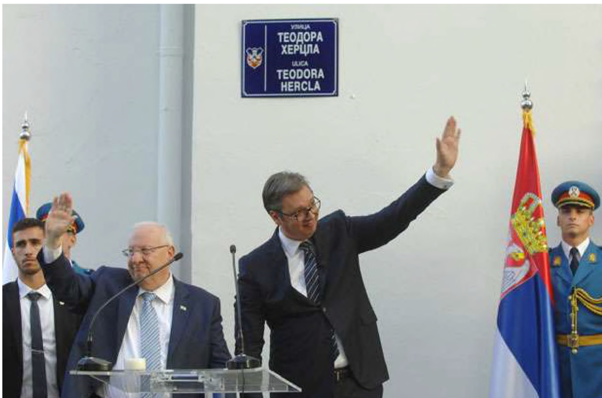
Predsjednici Izraela i Srbije u ulici Herzl Presidents of Israel and Serbia in Herzl Street